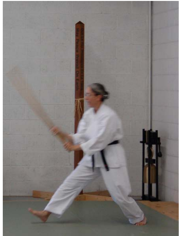
The Peace Pole at Aikido in Fredericksburg was a gift from senior students to the dojo. It has been on display inside the school for four years waiting for the completion of the new training center. It will be planted in the landscape during the March 27 ceremony.